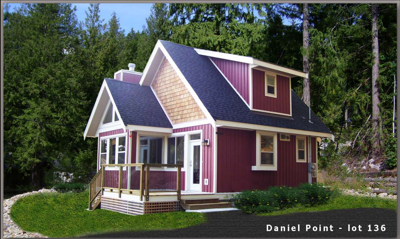
Daniel Point - lot 136