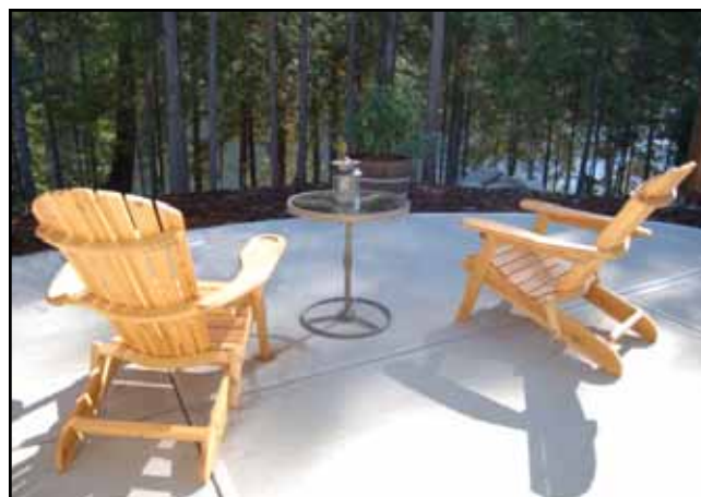
Private patios & decks