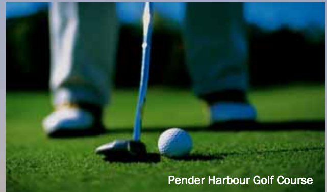
Pender Harbour Golf Course