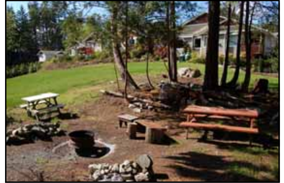
Stroll the trail, paddle the lake, catch a fish or make "marshmallow memories" picnicking around the fire pit with the grandkids.