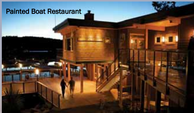
Painted Boat Restaurant