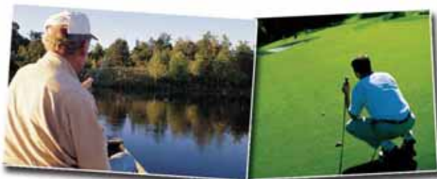
ROYAL LEPAGE SUNSHINE COAST, Madeira Park, BC